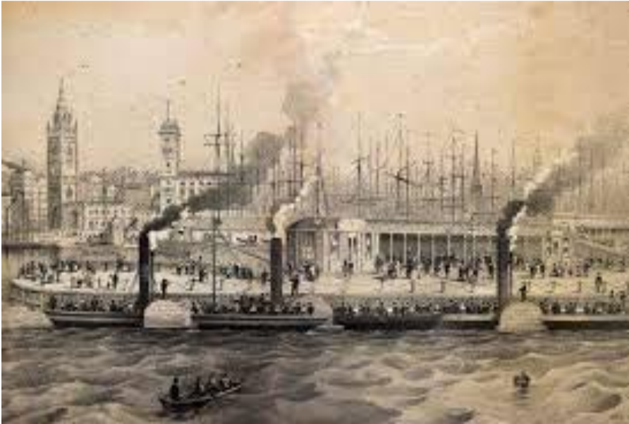
Liverpool Docks in the 1850's